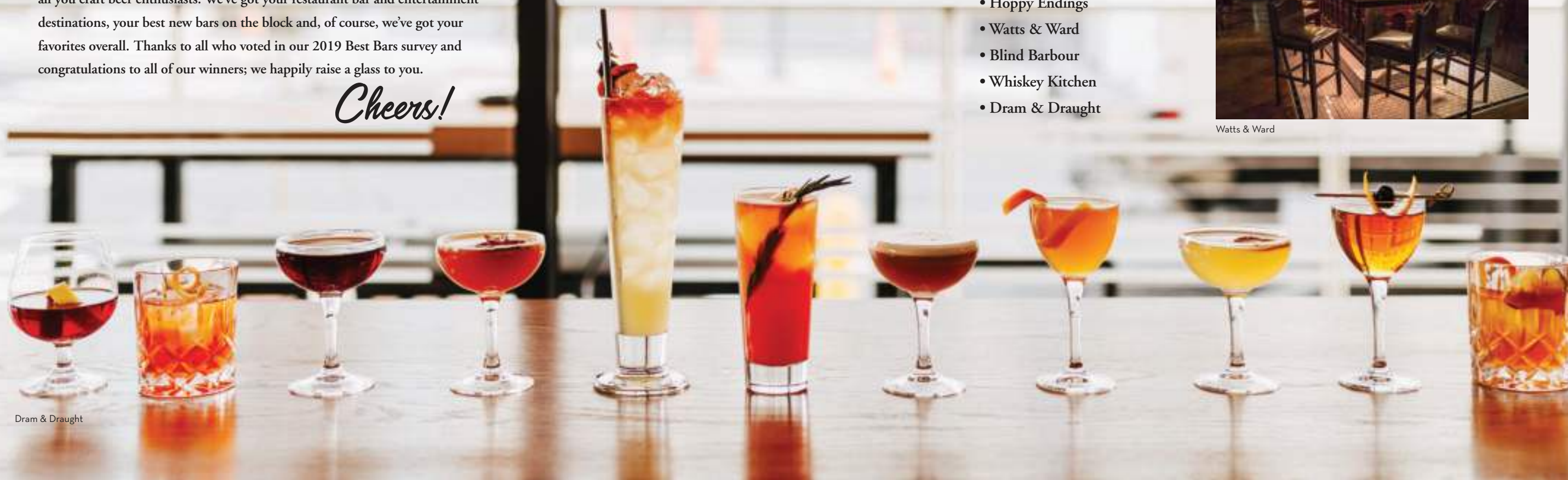
Dram & Draught