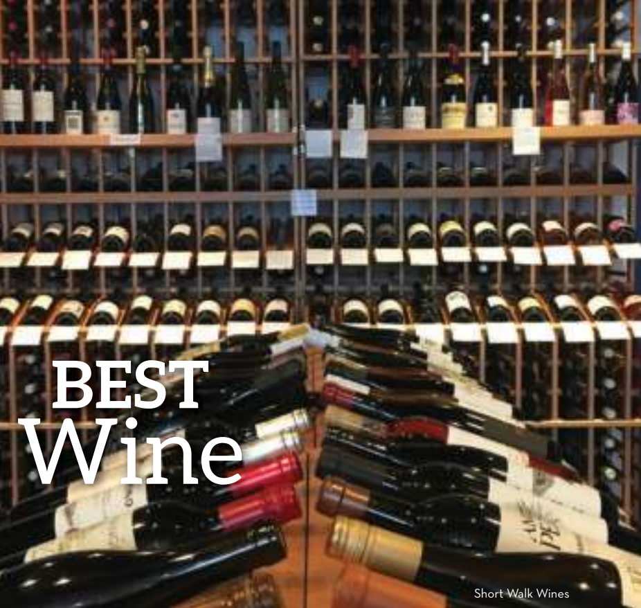
Short Walk Wines

Located in downtown Raleigh's historic Pow-erhouse building, Tobacco Road features a brewery, restaurant, private event space, game room and patio. The dining room is equipped with several TVs for all sports watching, as well as a giant screen that's visible from the upstairs overlook. Creative beers brewed in-house and an upscale bar menu add to the experience.