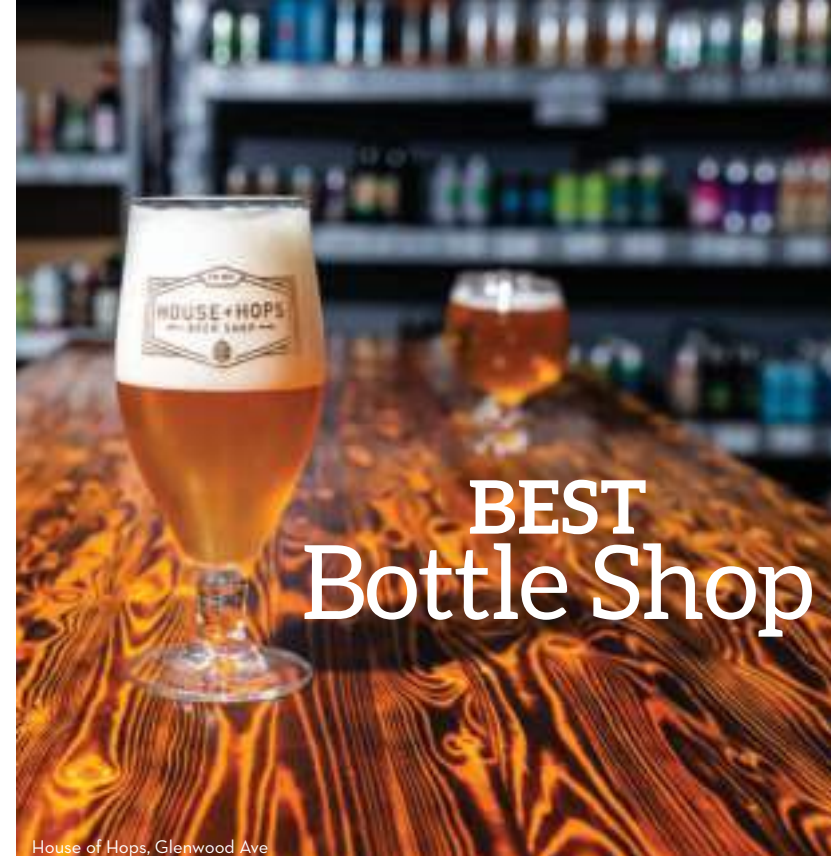
House of Hops, Glenwood Ave