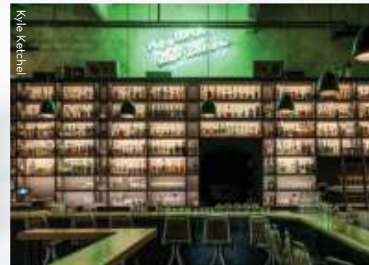
Dram & Draught