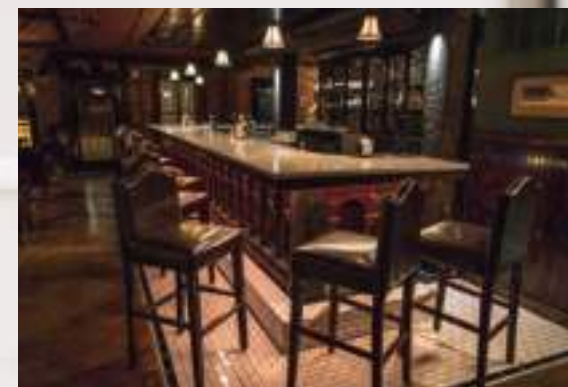
Watts & Ward